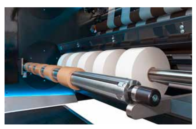
Expansion winding shafts Safe production for simple applications.