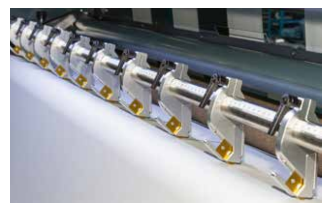
Razor blade cut Reasonable and good. Optionally as groove or mirror cut.