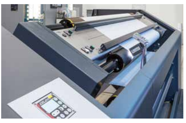
Splicing table and web control High-quality web connections – made simple. Choose the optimum splicing table.