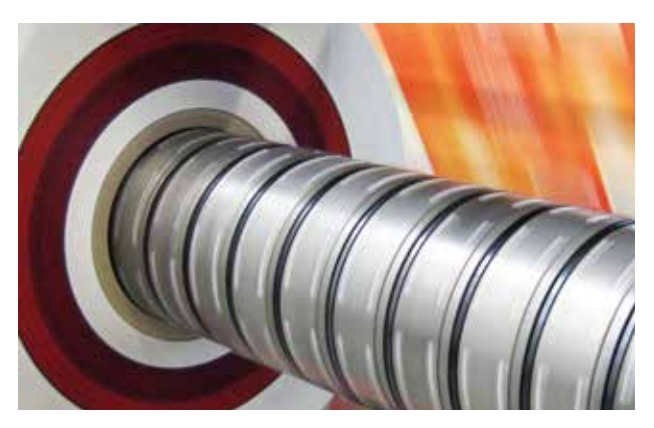
Friction winding shafts For reproducible quality and demanding materials.